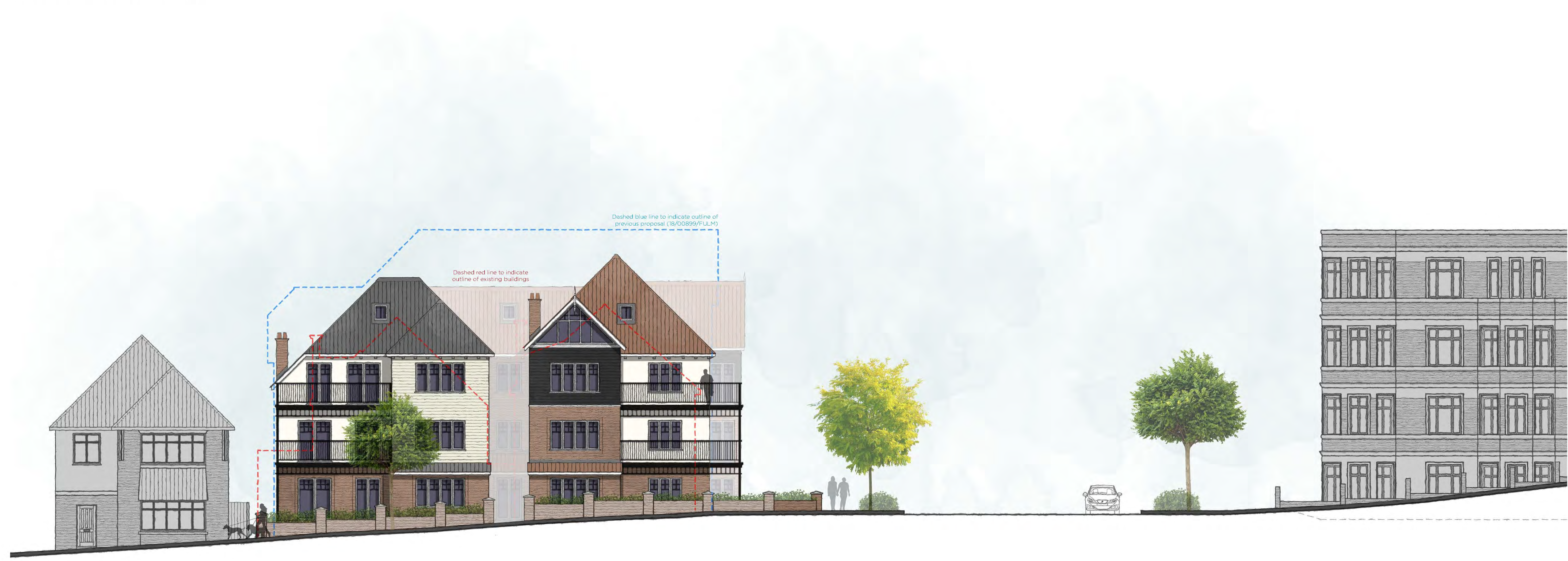
STREET-SCENE AA, along Crosby Road

125 Crowstone Road | Proposed Development | Footpath | Crosby Road | Footpath | Sunningdale Court